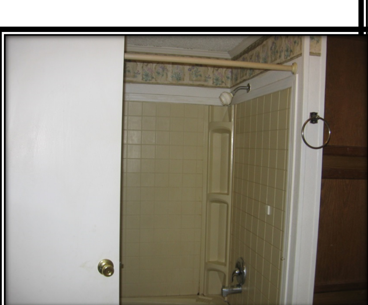
Bath 2 in Basement