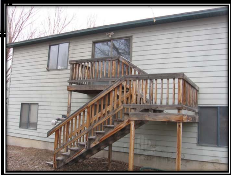
Stairs to Master Bedroom