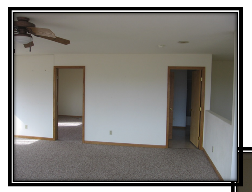
Extra Room off Master Bedroom (Sewing Room)