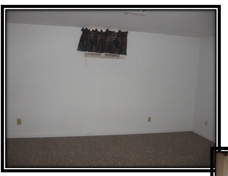
Den or Reading Room In Basement