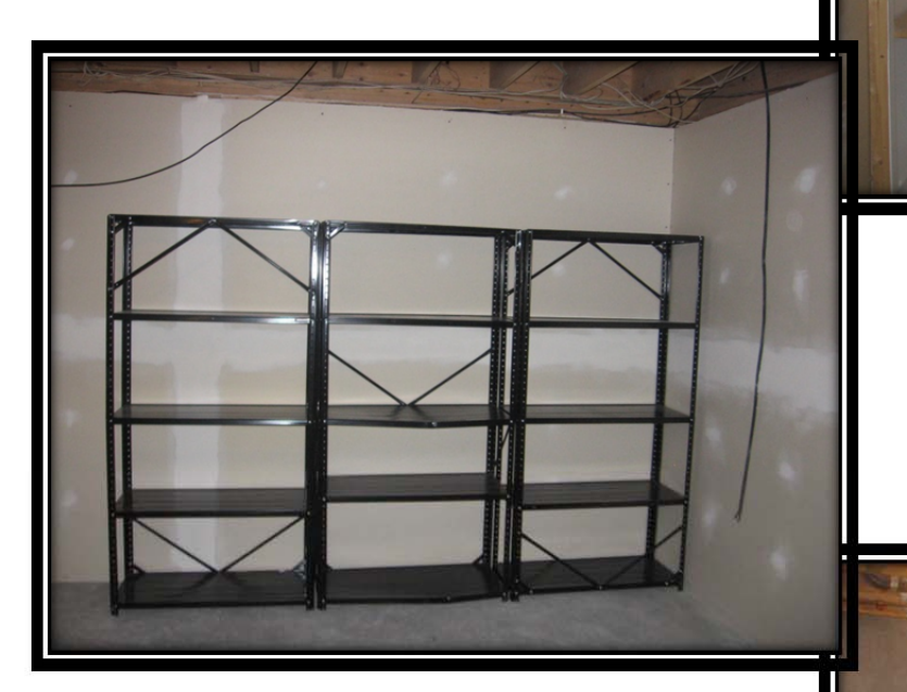
Laundry/Storage in Basement