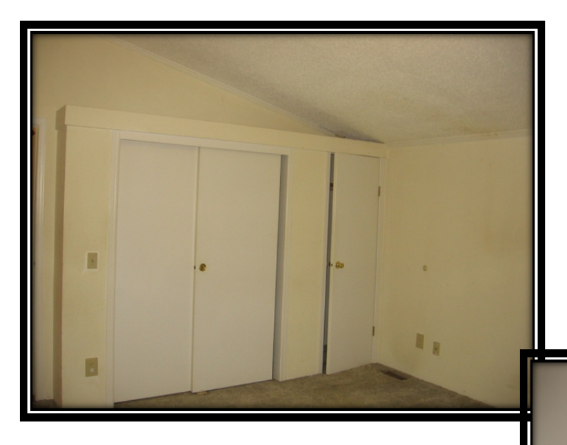
Bedroom on Main Floor